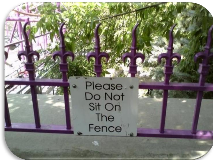
Do you think the sign is necessary?